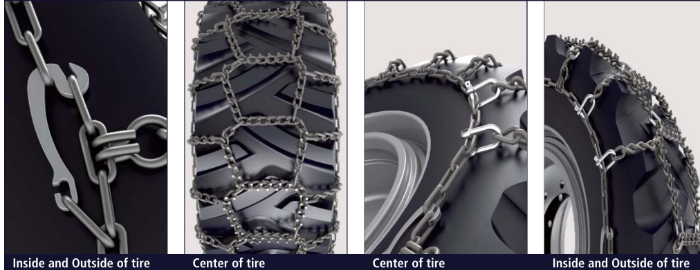
Inside and Outside of tire