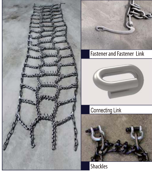
Fastener and Fastener Link